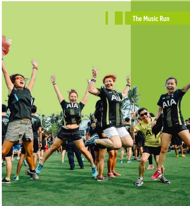
The Music Run