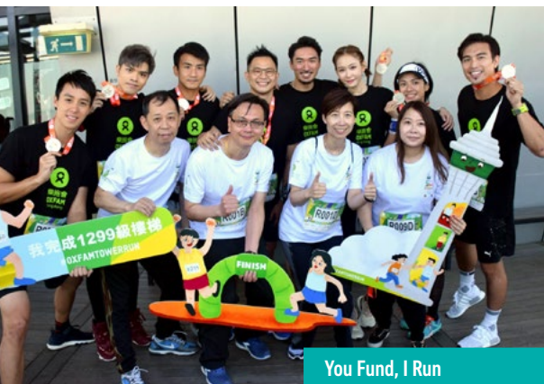
You Fund, I Run