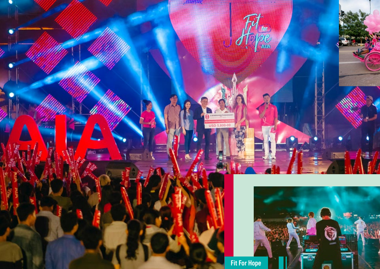
Fit For Hope