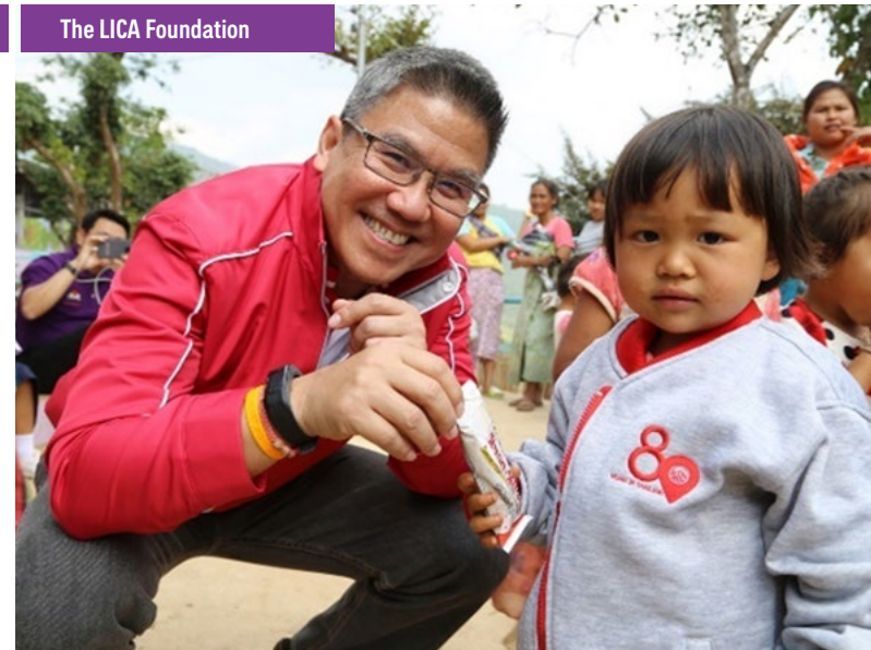
The LICA Foundation

EDUCATIONAL SUPPORT FOR A BRIGHTER FUTURE