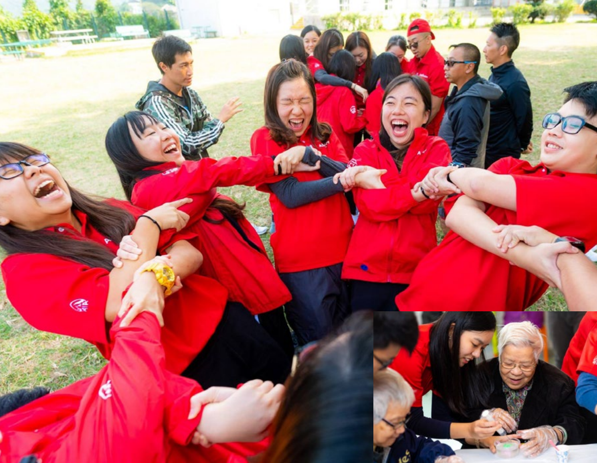
AIA Foundation Young Leadership Development Programme