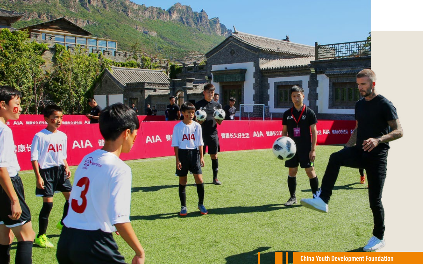
China Youth Development Foundation

“IT’S THE LITTLE THINGS THAT CAN HAVE A REALLY BIG IMPACT ON YOUR HEALTH AND WELL-BEING. IT JUST TAKES ONE CHANGE.”