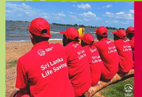
Life Saving Association

Life Saving Association of Sri Lanka, the Sri Lankan Police and the Sri Lankan Navy. As a result, there have been no deaths during the Posen season. This is our longest lasting Corporate Social Responsibility project, having commenced in 1993, and is estimated to have helped save at least 200 lives.