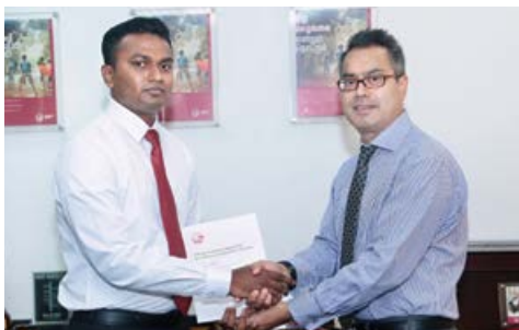
The student with the most outstanding academic performance in Wayamba University's Department of Insurance and Evaluation receives a six-month internship with AIA in Sri Lanka.