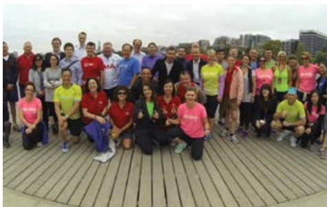
The 'Walk the Talk Challenge' in Australia offered a great opportunity for AIA employees to keep fit and meet new colleagues.