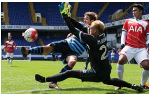
The AIA Championship brought together teams of AIA employees, customers, agents and the general public to compete for the chance to play at Spurs' White Hart Lane in London.

Our aim is to be a leading and valued supporter of football development in Asia. At the core of our association with football is our long-term partnership with English Premier League club Tottenham Hotspur (Spurs). Working together, both AIA and Spurs are engaging with local communities in the region to convey the positive values of teamwork, discipline, and sportsmanship, to positively impact people's lives. To-date, we have activated over 250 football-related events across 15 AIA markets and engaged tens of thousands of people across the region.