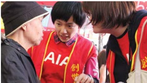
AIA volunteers helped prepare meals for the homeless and elderly at a charitable year-end party in Taiwan.