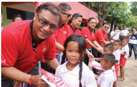
Since 2005, AIA has built libraries throughout Thailand to provide learning opportunities for students and the general public.

In Singapore and Indonesia , AIA invited over 145 school students to visit KidZania – an education and entertainment centre exclusively for children to role-play over 100 professions to spark their interest in exploring what they might become when they grow up. In Indonesia , AIA also took the opportunity to present to the students a collection of books donated by employees through the company's '1,000 Books for AIA Village' programme, launched in early 2016. In Singapore , AIA took this relationship one step further by partnering with KidZania to host an 'AIA Insurance Office' at the venue. This allowed children to play the role of an AIA Financial Services Consultant to learn the basics of insurance and the crucial role it plays throughout their lives.