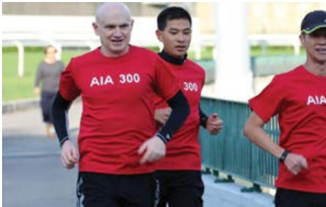
A record number of runners from AIA's Group Office came together to run 553km between them in support of Operation Santa Claus.

Regular exercise is a key contributor to healthy living and at AIA we encourage those in our local communities to take part in a wide range of physical activities.