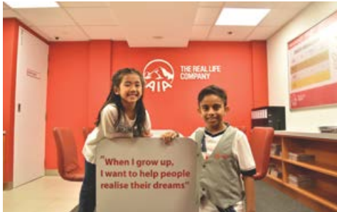
Children were given the opportunity to visit an 'AIA Insurance Office' at KidZania, to role-play being an AIA Financial Services Consultant.

The strong link between education and health is well established. Many of AIA's businesses have long-lasting partnerships and programmes through which they support the education of children and young adults.