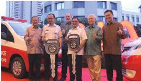
AIA Group presented the Health Department of the Jakarta Government with two ambulance units.

Building strong, harmonious and safe communities enables their environmental, economic and social development. AIA is committed to helping empower its local communities to thrive and create a better future for all.