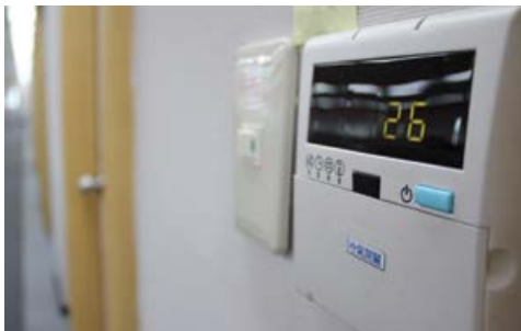
AIA's 'Save Energy, Save Earth' campaign at our Taiwan headquarters helped raise awareness of environmental protection among employees.

In Thailand , AIA Sathorn Tower receive 'The Best Green Development Award' at the Thailand Property Awards 2015, one of several successes on the night. This was followed later in the year by the 'Highly Commended Best Green Development (South East Asia)' award at the South East Asia Property Awards.