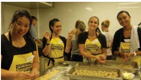
Groups of AIA employees in Australia helped transform food otherwise destined for landfill into delicious meals for people in need.

In Hong Kong , AIA launched a 'Let's Work Together' campaign to encourage further diversity in the workplace and actively promote equal job opportunities for people with disabilities. To kick off the campaign, AIA partnered with a non-profit organisation known as Care-ER – a registered charity supporting highly-educated people with a disability to achieve their employment goals – to produce a series of videos highlighting the valuable contributions people with disabilities offer their employers. In addition, AIA's Pension & Trustee business in Hong Kong expanded efforts to better serve its customers with special needs through the development of a refreshed, barrier-free website and by providing customer service counters equipped with magnifying glasses and text-to-speech screen readers to assist the visually-impaired.