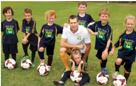
The MiniRoos programme introduced boys and girls to football through short, game-based sessions.