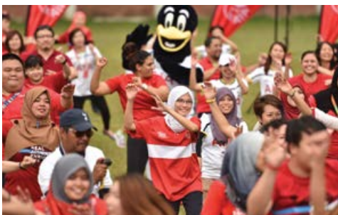
In Malaysia, over 500 employees and agents took part in the 'AIA Great Warm Up' Zumba session.

In Hong Kong , AIA is the proud Principal Sponsor of the 'Oxfam Trailwalker.' This is one of Hong Kong's largest, most challenging and popular fund-raising sports events, supporting Oxfam's poverty alleviation and emergency relief projects. In 2016, AIA was the largest corporate participant, setting a record by having 29 teams participating in the event.