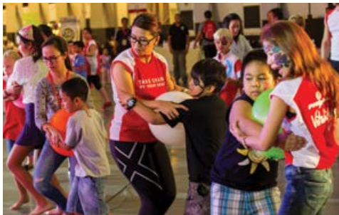
In the Philippines, AIA employees and their families took part in healthy activities at the Philam Group Family Fair.