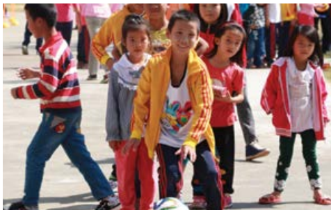
In China, AIA held a series of 'Happy Sports Field' events at immigrant schools in Guangdong and Shenzhen.

AIA's association with football encompasses a living embodiment of the AIA brand promise – to help people lead longer, healthier, better lives.