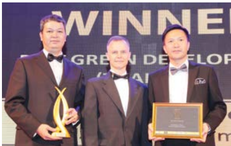
Among several awards acknowledging AIA's efforts to reduce our environmental footprint, we won a 'Best Green Development Award' for the AIA Sathorn Tower in Thailand.

AIA is committed to managing and mitigating our environmental footprint. As a financial services provider this means reducing the energy we use, the paper we consume and the extent of our business travel.